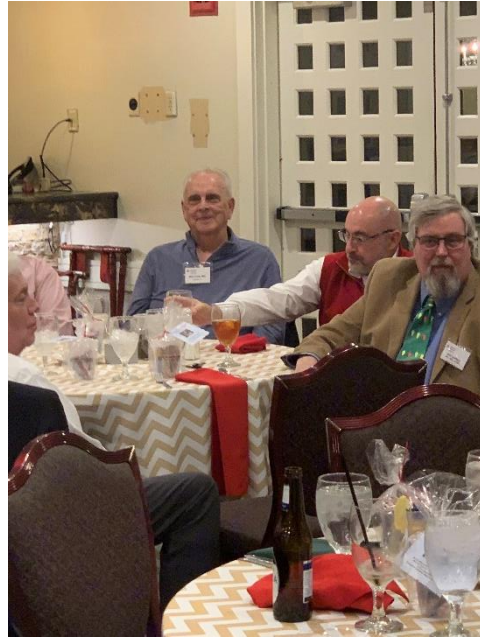
Members in attendance