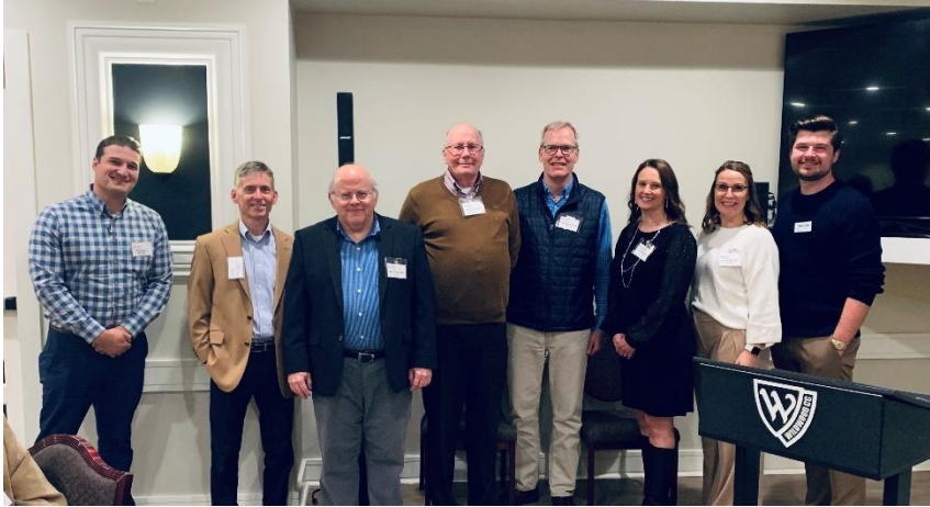
2024 Board of Directors